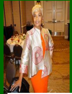
CVC Founder's Day