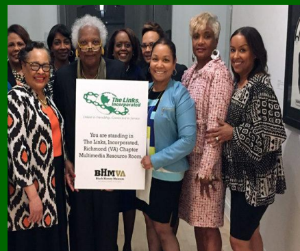
Richmond (VA) Chapter $100,000 Contribution to the Black History Museum of Virginia