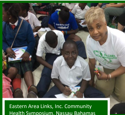
Eastern Area Links, Inc. Community Health Symposium, Nassau Bahamas