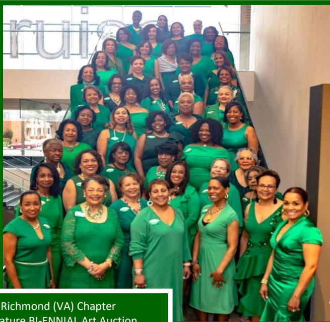
Richmond (VA) Chapter Signature BI-ENNIAL Art Auction