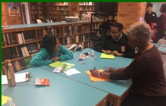
Interacting With Richmond (VA) Chapter Umbrella FMA 2 Project