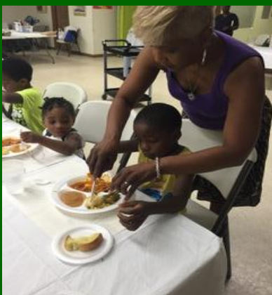
Serving Plated Dinners to Youth for Day of Service